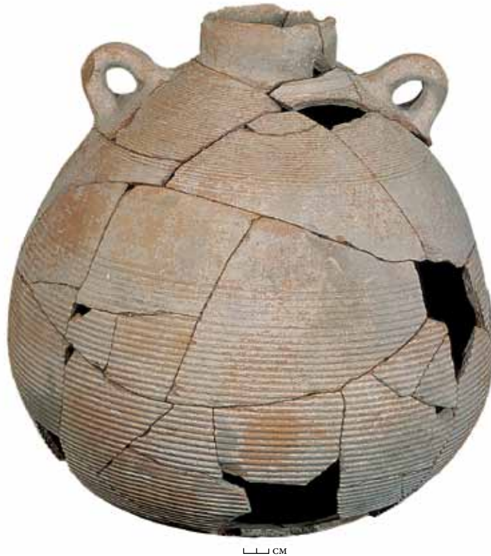
Figure 13. Palestinian LRA 5. AM263.

Within the four variants classified under this form, there are two basic shapes distinguished. One has a cylindrical collar neck and a concave band-rim face and is Flavian in date (Form 2A). Two other variants (Form 2C–D; Plate 49c) have a sloping neck, similar to that of Form 1, but differ from Form 1 in having a wide concave band rim and a rather wide rim diameter, as well as thicker walls. The thick-walled, hollow-foot Base 5 (Plate 43) is possibly its base type, though the latter may also be a Cadiz or even Rhodian amphora. Form 2C–D should perhaps be considered a separate form within this general class, particularly given that they were contemporary late Augustan / Tiberian finds with the quite distinct rims of Form 1. Form 2C–D finds are especially common in the Balih Valley at Hammam-et-Turkman and other sites, where they seem to be associated with late first-century B.C. to early first-century A.D. material (so similar to Zeugma). Form 2B, Flavian, with its markedly beveled rim face, has a profile more in line with Form 1 and Form 2A. The hollow-toe bases found in Flavian contexts (Base 4) could equally belong to Form 2 and indicate that all variants of Form 1 and Form 2 (late Augustan to Flavian) were similar in body and toe shape. It is assumed here that a ring handle that occurred in a Flavian context does not belong to Form 2 (AM79, 7007.10).