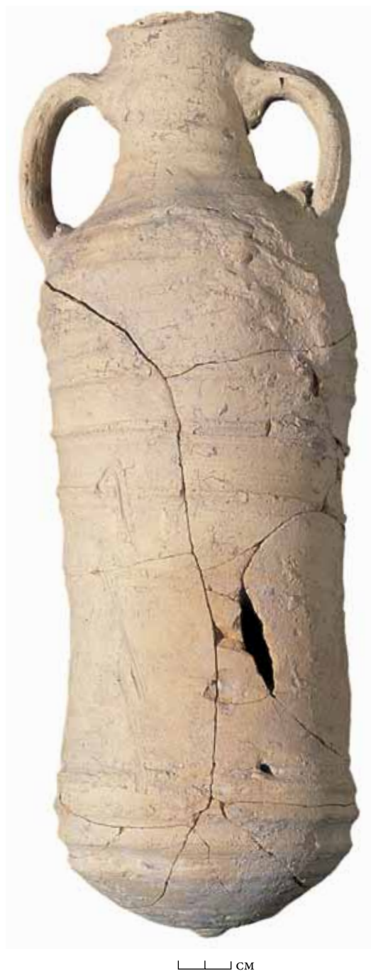
Figure 12. Narrow-bodied LRA 1. AM336bis.

The distribution of Form 1 covers a wide area comprising the Balih Valley, the most western section of the Eu-