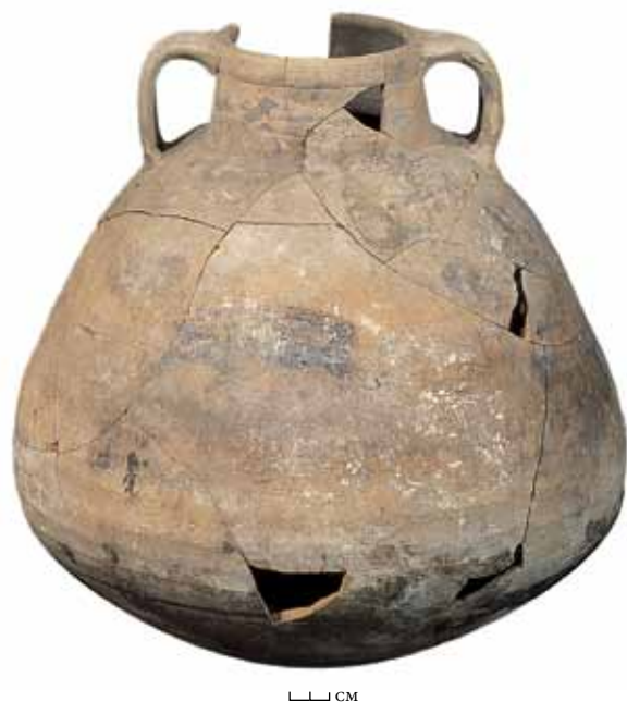
Figure 2. Form 3D AM148.

Imports are rare and largely restricted to Rhodian amphora fragments (AM72, 2283.1; AM75–76, 2300 × 2). A large hollow base seems to be in Fabric 1 (for the thick-walled Form 2C–D?) (AM88, Base 5: 7007.1). Alternatively it may be a late Rhodian base type (similar occur in Beirut) or even a Cádiz fish-sauce amphora toe. The hollow Base 6 (AM24: 15009.8) is possibly Cretan. One could say that Zeugma's isolation from long-distance supply networks was even more marked in this period.