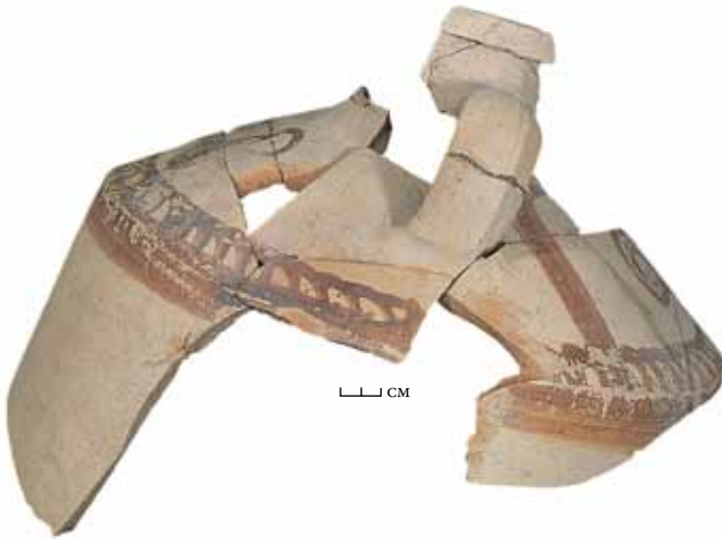
Figure 7. Small Form 17A AM310.

The most common long-distance imports are amphorae from Sinope, on the Black Sea (e.g., AM324, figs. 10–11: 7060.14, almost complete; AM440, 441, and 449: 12011). During the late fifth to seventh centuries these were fired to a pale greenish-white color, 45 and sherds and even handles are sometimes difficult to distinguish from those of the equally common form “Late Roman Amphora 1” / Peacock and Williams Class 44. 46