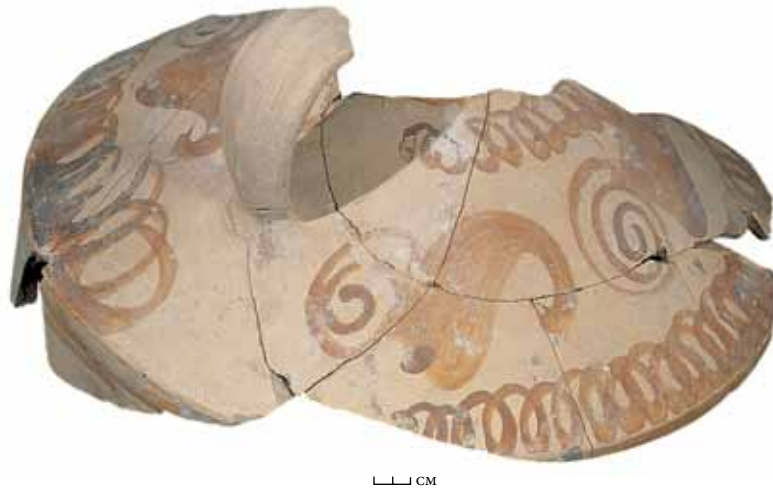
Figure 6. Large Form 17A. AM296/303.

route linking the Mediterranean (Seleucia-on-the-Orontes and Antioch) to Mesopotamia, Iran, and India beyond must surely account for such a focus of Syrian-Euphrates imports in this period.