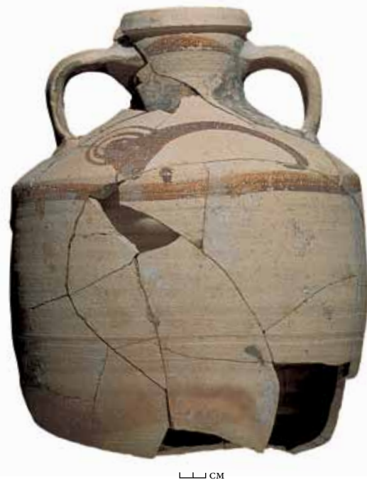
Figure 8. Small Form 17A. AM335.

The comparison of the supply of imported amphorae to Zeugma on the Euphrates and Beirut on the coast of Syria Libanensis highlights major differences in the supplies of the first and third centuries, as it does the notable similarities between them in the seventh century. Long-distance amphorae from Baetica and Campania that were an important feature of Beirut assemblages in the first century are not encountered in Zeugma, even though both sites share imports of Italian fine wares and cooking wares. 74 Amphorae in early first-century deposits at Zeugma are