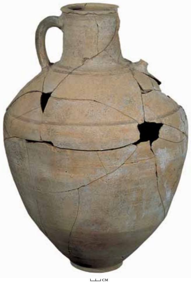
Figure 3. Form 13D. AM202.

What does continue and is another major feature of local amphora production is the globular amphora with a collar neck, band rim, and strap-handles attached from the rim to the shoulder (Form 3). Examples of third-century date, best illustrated by the complete example AM148 (2017.1: fig.