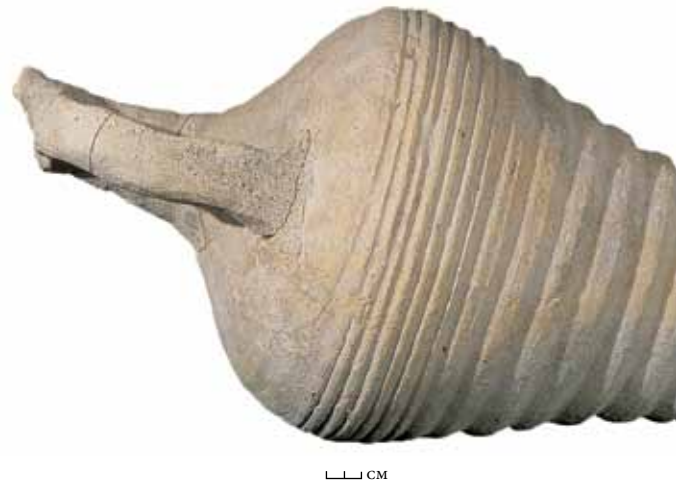
Figure 11. Sinope amphora. AM324.

Buff ware 1 and 2 equal (Amphora) Fabric 1 and Fabric 2. In other words, no change. Buff ware 2 / Amphora Fabric 2 was established to distinguish the more lime-rich examples of (local) Buff ware 1 / (Amphora) Fabric 1. Chris Doherty, on the other hand, has reasonably demolished this tenta-