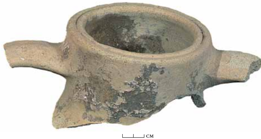
Figure 4. Form 16A. AM270.

2), have a rounded base. Two principal variants of Form 3 are found in third-century levels, one is thin walled and well fired (Form 3D–E), the other is thicker walled with a wider band rim (Form 3F). The variant Form 3G is related to the latter.