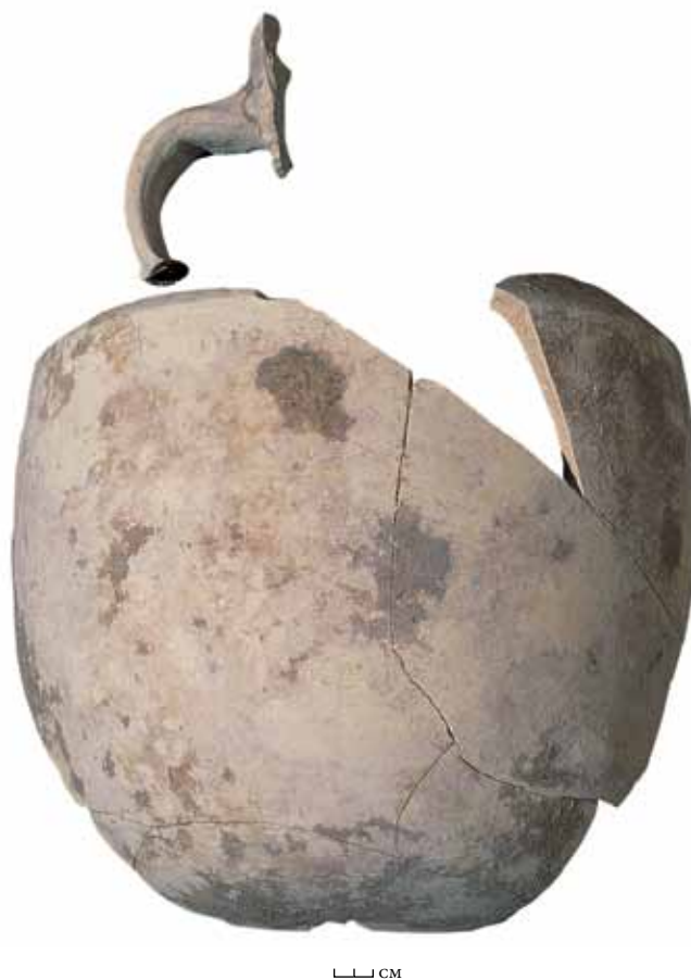
Figure 5. Form 16A. AM332.

A single handle fragment of a Gazan amphora and a wall of a bag-shaped Palestinian amphora found in mid-