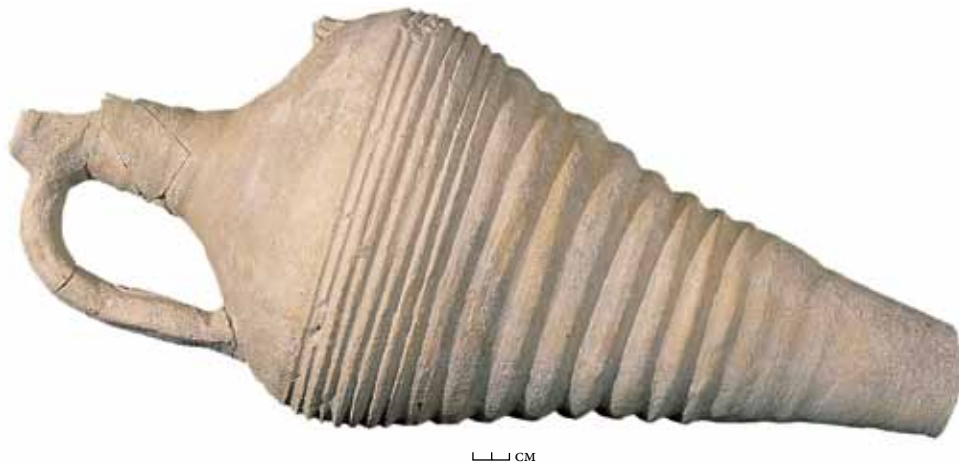
Figure 10. Sinope amphora. AM324.

The distribution of imports and Syrian amphorae in inland Syria is surely in part explained by the location and continued links of sites with the provisioning of the Byzantine limes, with Seleucia-on-the-Orontes and Antioch acting as the initial focal point for the redistribution of imported amphorae and fine wares, and sources along the Euphrates supplying their local regional amphora-borne products more directly to sites on the Euphrates. The range