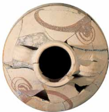
Figure 9. Small Form 17A. AM335.

predominantly either local (Form 3) or from close regional, probably Syrian sources (western Euphrates, or in the Balih Valley?) (Form 1; Form 2C–D). Form 1 and Form 2 may well be Parthian transport amphorae — they are certainly found in Parthian territories from the Balih Valley to as far east as Dura-Europos. The flow of these amphorae to Zeugma may partly be due to the major caravan trade route in exotic goods that connected Hellenistic and, later, Roman Antioch and the Mediterranean to Mesopotamia and the Far East as it breached the Euphrates at Zeugma. The city thus acted as a bridge between Rome and Parthia and a high-earning customs point for Roman Syria, in the same way that Palmyra controlled eastern trade further to the south. This trade did not result in large-scale amphora-borne imports from the west, however. The isolation of Zeugma may even have increased in the Flavian / Trajanic period, imports being almost entirely solely from the same close regional source as earlier in the century (Form 1 and Form 2).